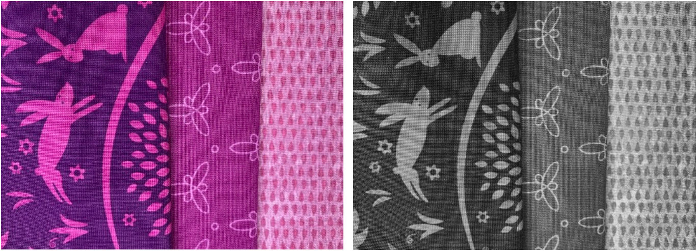
Fabric choices with dark, medium, light value

One tip to test your chosen fabrics is to take a photo of the three fabrics together, then use the black and white setting on your phone camera to view the photo in black and white. As you can see from the photo below, you can clearly see the value difference between these three fabrics: dark, medium, light. (Note that choosing a dark fabric without such a large lighter design would provide even more contrast.)